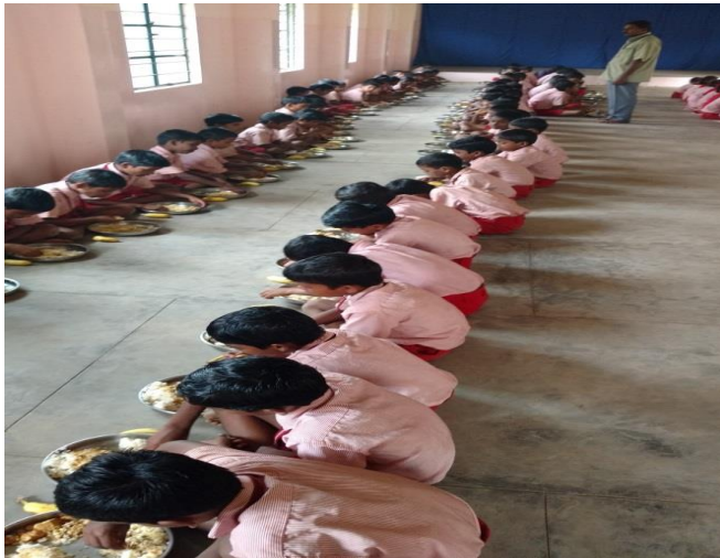
Students Lunch Time

We celebrate Independence Day and Republic Day and conduct various competitions which will cultivate patriotism in the hearts of our students. Our teachers train the students to perform cultural program during the celebration based on the heritage and culture of our nation. Service of our Organization among these tribal children is very essential in order to civilize the lives of the Tribes from the younger generation.