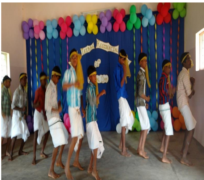
Tribal Boys Cultural Program