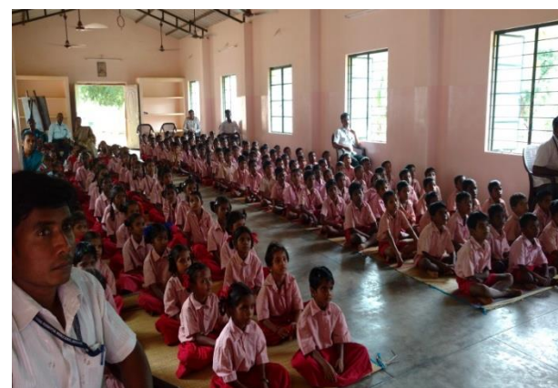
Tribal Project Officer addressing the Student's and Staff.

Our Warden and Part-time Teachers give special attention by coaching the students in the evenings after school. We provide food and Shelter along with periodical medical care with the help of our Doctors who visit our hostel periodically and when required in case of emergency. Every Month a youth team from Chennai meets our Tribal Students and make them cheerful with different activities and make them to learn good practices. We take our Tribal students on education tour every year to gain a different exposure in cities and towns different from their interior tribal hamlets.