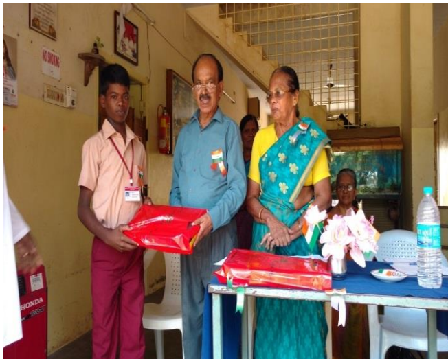
On August 15 th ,2017 Prize Distribution

We celebrate Independence Day and Republic Day and conduct various competitions which will cultivate patriotism in the hearts of our students. Our teachers train the students to perform cultural program during the celebration based on the heritage and culture of our nation. Service of our Organization among these tribal children is very essential in order to civilize the lives of the Tribes from the younger generation.