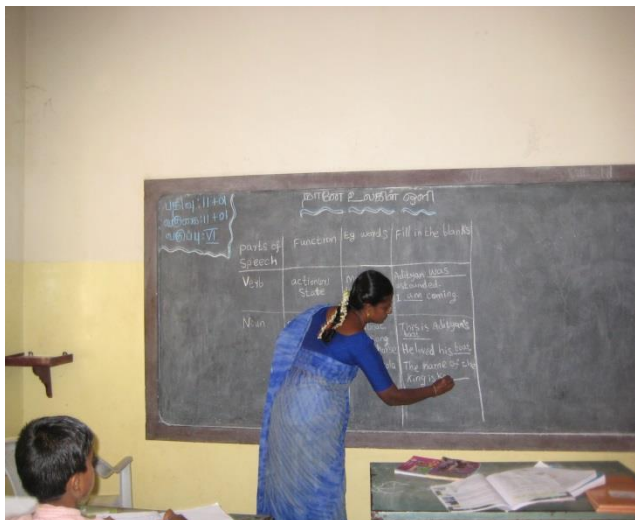
Head Mistress taking English Class