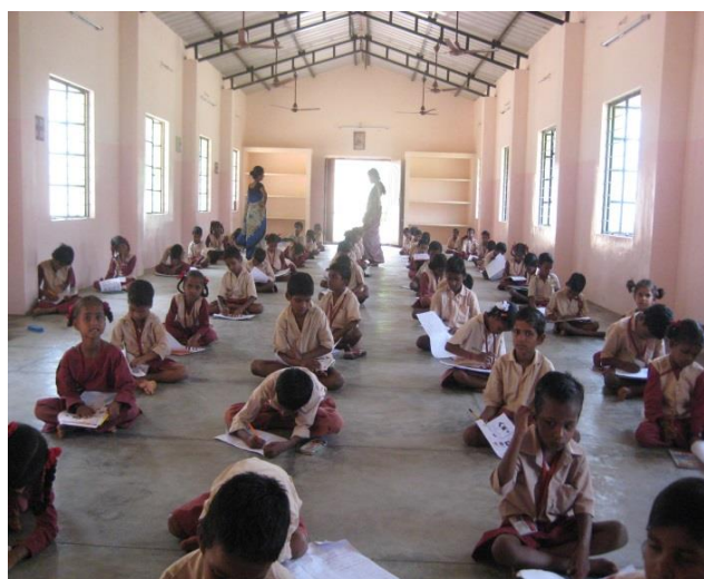
Students Writing their Exam