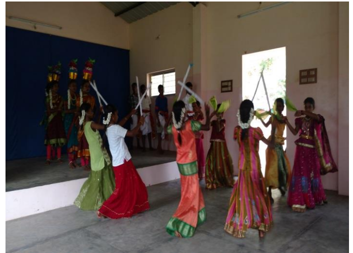
Tribal Boys Cultural Program