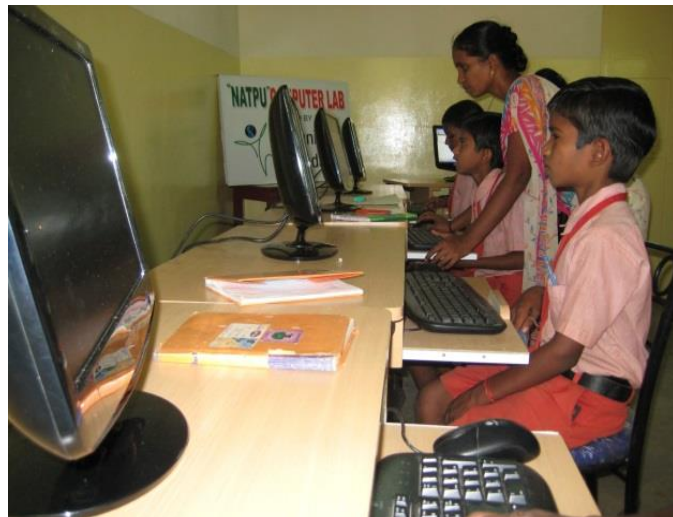
Vocational Training Unit